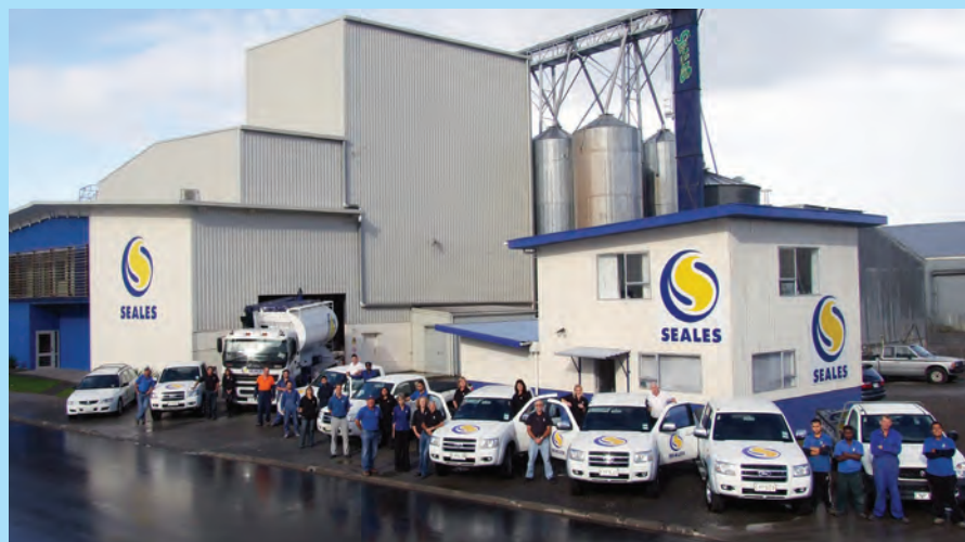
Seales Ltd, based in Morrinsville, Waikato, is New Zealand's largest independent feed mill

Winslow Feed and Nutrition is a division of Winslow Ltd, based in Ashburton. It is the South Island's leading ruminant feed mill. The business provides custom-blended and pelletised feeds and also produces feedblocks, milk additives, silage inoculants and mycotoxin neutralizers.